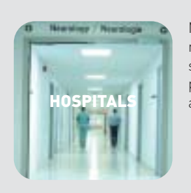
Medical alert monitoring, sterilization, blood products storage and transport