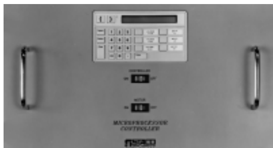
Rack Mounted Microprocessor Controller