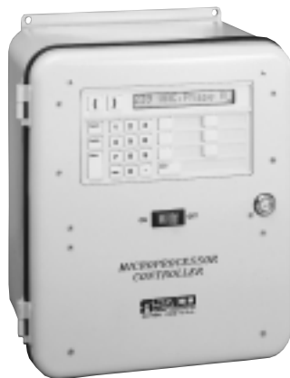
Controller with Enclosure Mounted Microterminal Option